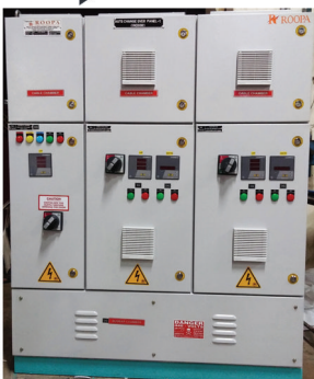
Auto Change Over Panel

LT Switchgear Panels LT Bus Ducts Electrical TurnKey Projects Cable Trays